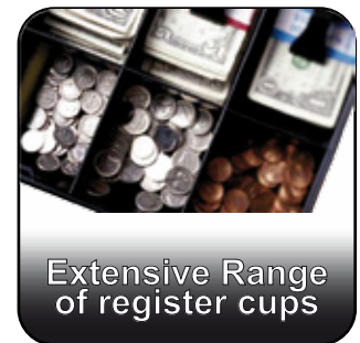
Extensive Range of register cups

Established in 1977, our organization has been involved in electronic cash counting systems since 1987. Cashmaster specializes in providing cash intensive businesses with the tools necessary to count and reconcile cash more efficiently. Sectors such as retail, grocery, banking, quick serve restaurants, and c-stores all benefit from using Cashmaster products. Cashmaster offers four different products to suit all levels of users, from single till operations to multinational chain stores that operate multiple tills per store.